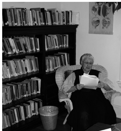
Tonen in MZC's library

As these ideas develop, the most up-to-date information will be available on our website.