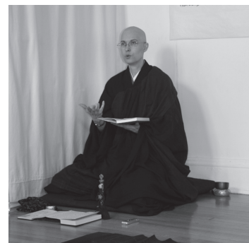
Sunday mornings will include a dharma talk.

A brief informal teatime will follow the talk so that folks can meet and get to know one another.